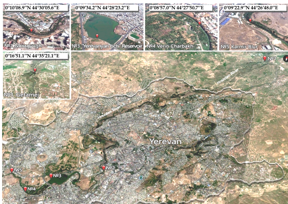
Fig. 1. Map of monitoring and sampling sites in “Yerevanyan Lich” Reservoir and the Hrazdan River.

Materials and Methods. The quantitative and qualitative parameters of phytoplankton community in “Yerevanyan Lich” Reservoir and the Hrazdan River were investigated. Phytoplankton studies in the aquatic ecosystems were performed in 5 monitoring sites: 2 river sites located upstream from “Yerevanyan Lich” Reservoir (no. 1 and 2), 2 river sites located downstream from the reservoir (no. 4 and 5) and a “Yerevanyan Lich” Reservoir site located near the dam (no. 3) (Fig. 1). Phytoplankton samples were collected once a month in April and June–August 2015. A 1-liter water sample taken from each site was preserved with 40% formaldehyde solution (0.4% final concentration) and stored in a dark place. Further study was carried out under laboratory conditions. The fixed phytoplankton samples were settled in a dark space for 10–12 days, and then the volume of the experimental samples was decreased from 1000 mL to 100 mL by a siphon (50 \mu m). Repeating the same process for the second time, the volume of the experimental samples was reduced to 10 mL [12]. The qualitative and quantitative analyses of phytoplankton were executed under a microscope using Nageotte chamber. Taxonomic groups of phytoplankton were identified using the keys/determinants of freshwater systems [13–17]. Water temperature measurements were conducted in field conditions, using a digital thermometer (ST9265).